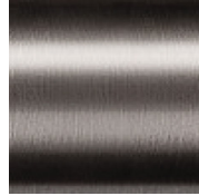
NICKEL COATED BRASS