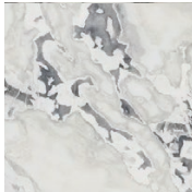
DOVER WHITE MARBLE