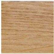
NATURAL LACQUER OAK