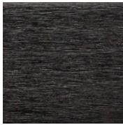
BLACK LACQUER OAK