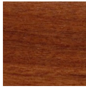
MAHOGANY LACQUER OAK