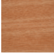
NATURAL ASH WOOD