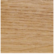
NATURAL LACQUER OAK