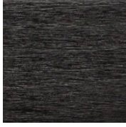
BLACK LACQUER OAK