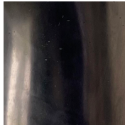
BLACK PATINATED BRONZE