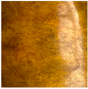
ANTIQUÉ GOLD PATINATED BRONZE