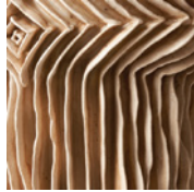
SAND GLAZED STONEWARE