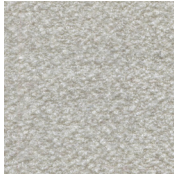
IVORY HOLLAND AND SHERRY