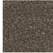
MOCHA HOLLAND AND SHERRY