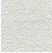
SNOW HOLLAND AND SHERRY