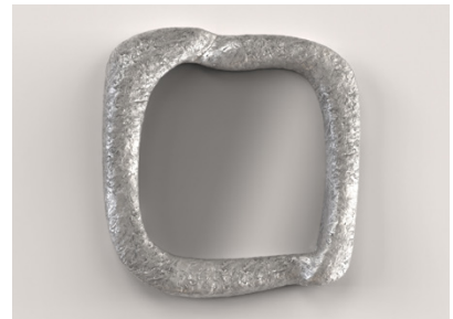
ALUMINUM CAST ALUMINUM