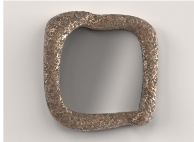
BRUSHED BROWN BRONZE