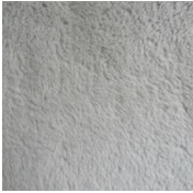
GRIS DIOR TIMO