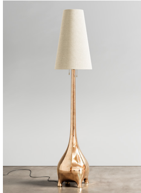
POLISHED CAST BRONZE