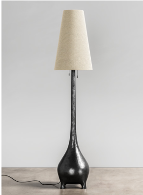
BLACK PATINATED CAST BRONZE