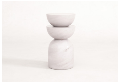
WHITE ESTREMOZ MARBLE