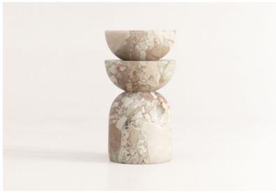
BRECCIA BOTTICELLI MARBLE