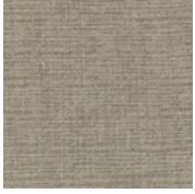
PIERRE COTON TORSADÉ