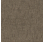
JAVA PARKER JUTE HERRINGBONE