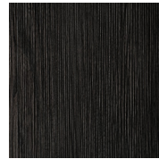
SMOKED EBONY OAK SANDBLASTED