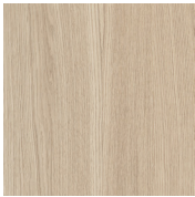
NATURAL OAK MATTE VARNISH