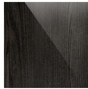
SMOKED EBONY OAK ULTRA-GLOSS