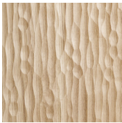
NATURAL OAK MATTE VARNISH