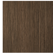
TOBACCO OAK SANDBLASTED