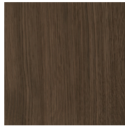
TOBACCO OAK MATTE VARNISH