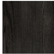
SMOKED EBONY OAK MATTE VARNISH