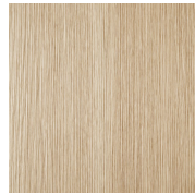
NATURAL OAK SANDBLASTED