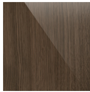
TOBACCO OAK ULTRA-GLOSS