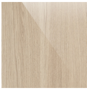
NATURAL OAK ULTRA-GLOSS