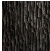
SMOKED EBONY OAK MATTE VARNISH