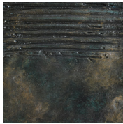
ANTIQUE BRONZE PLASTER