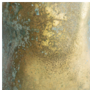
OXIDIZED GOLD PLASTER