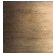
GOLD WAXED PLASTER