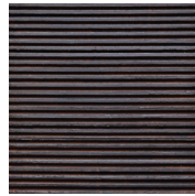
EBONY RIDGED PLASTER