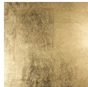
24K GOLD LEAF PLASTER