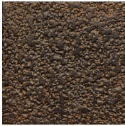
ELEPHANT SKIN PLASTER