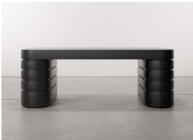
BLACK LEATHER UPHOLSTERY