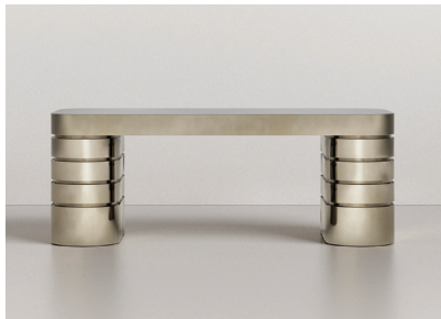
SILVER PLATED METAL