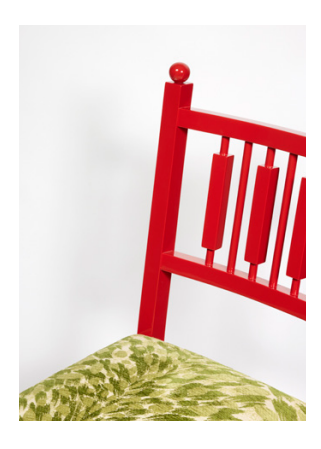
MUGUET PONDICHERY CHAIR