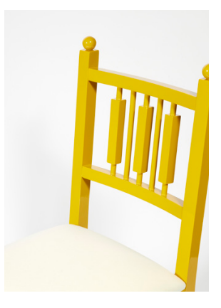
MIMOSA PONDICHERY CHAIR