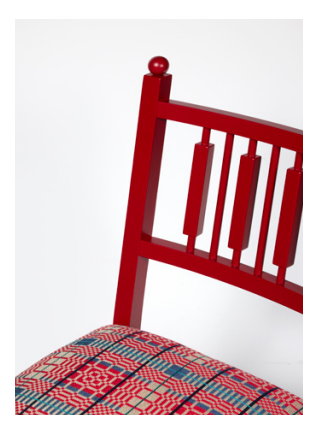
CHERRY RED PONDICHERY CHAIR