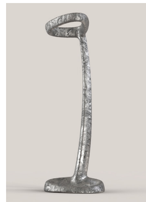
ALUMINUM CAST ALUMINUM