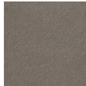
006 CASTORO ADORABILE ALPACA