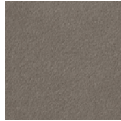
006 CASTORO ADORABILE ALPACA