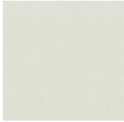
F6930-05 CREAM SKERRY