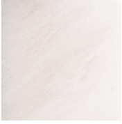
WHITE ESTREMOZ MARBLE