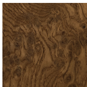
BURL OAK TOP