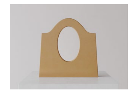
TT2SE.08F.L WHITE LEATHER