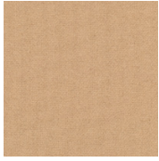
223 LIGHT BROWN FABRIC