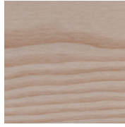
NATURAL DOUGLAS WOOD