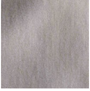
BARLEY ALPAGA VELVET