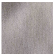
BARLEY ALPAGA VELVET