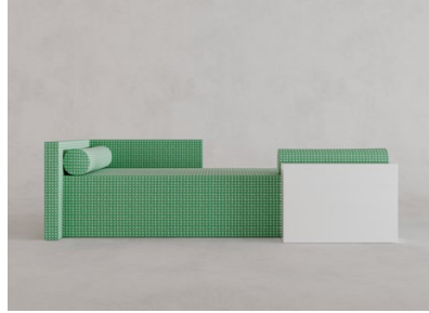
GREEN QUEEN EUCLIDE