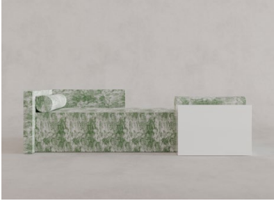
VERDE DERBY TOILE