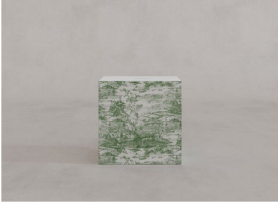
VERDE DERBY TOILE