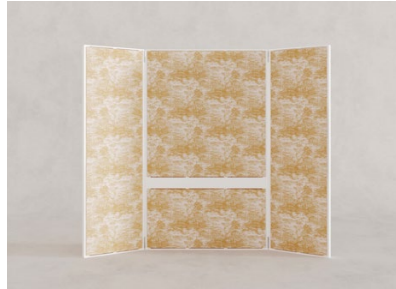
ORO DERBY TOILE