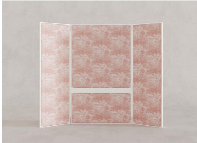
ROSSO DERBY TOILE