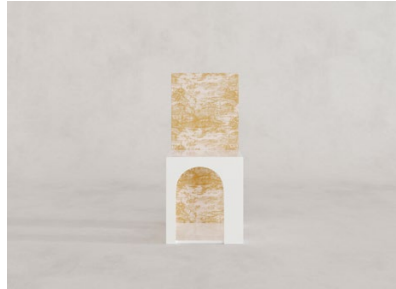
ORO DERBY TOILE