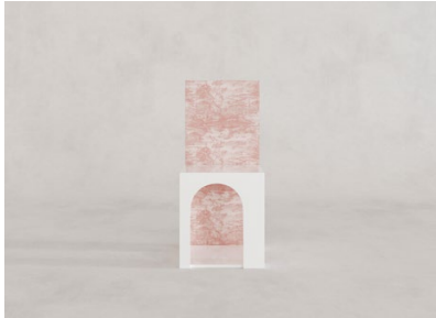
ROSSO DERBY TOILE