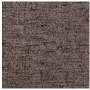
BENU RAW RECYCLED FISCHBACKER 1819