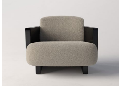
CREAM & BLACK SIERRA AND LACQUER