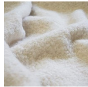
WHITE SIERRA BY INATA