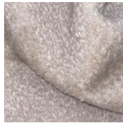
CREAM SIERRA BY INATA