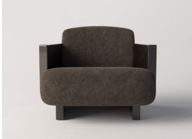
CHESTNUT & BROWN SIERRA AND LACQUER