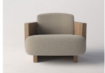
CREAM & BRUSHED OAK SIERRA AND WOOD